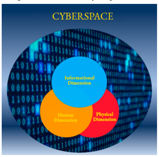
Figure 1 – Dimensions of the operating environment